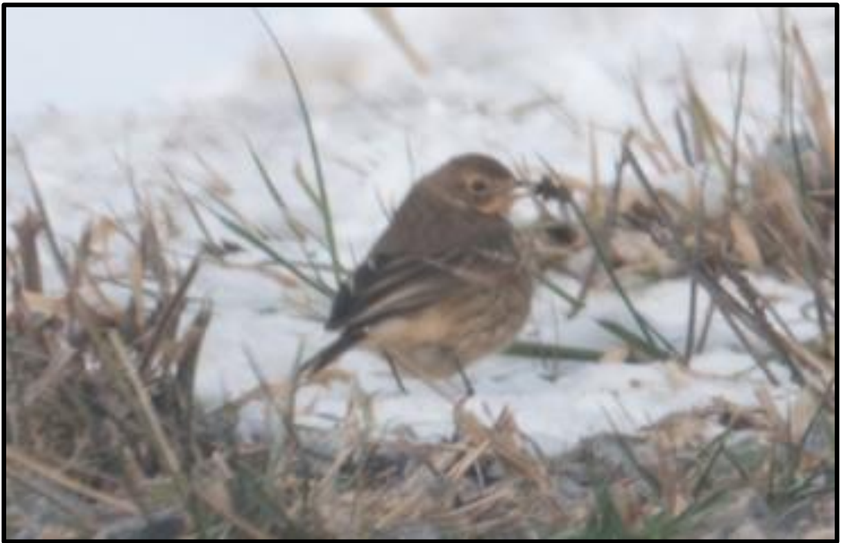
An American Pipit found on open farmland around Clairmont Road and Brooklyn Street NE of Kingston. Photos by Andrew Bates taken Dec. 26, 2024.

We had 79 species on count day, almost 17 species above the latest ten-year average and 7 species higher than our previous best. With 1 additional Count Week species the Total Species was 80, nearly 12 above the 10-year average and 2 above the previous best. The total number of individuals was 10719, only slightly below the 10-year average, but more than 3,400 above last year's meager total. Most abundant species were European Starling (3091), Dark-eyed Junco (1020), Canada Goose (864), Blue Jay (808), Mourning Dove (728), Black-capped Chickadee (700), American Goldfinch (516) and American Crow (479). Of the 39 species seen on 90% or more of the last 10 counts, all were seen except for Green-winged Teal. Among the less common species missed, Northern Goshawk and Common Redpoll were the only ones that we have had 50% or more of the time in the past decade. Only one species was seen in the Count Week but not on Count Day: an American Pipit which was the first ever on the count.