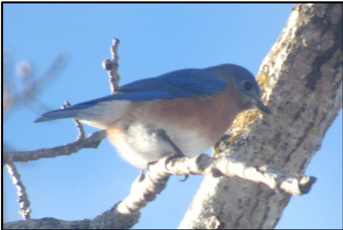
A new Count Day species for the Kingston CBC.

One of 5 Eastern Bluebirds at Middleton, in Zone 4.